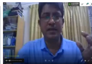
Webinar on Rethinking Sustainable Development In Post Covid Period: From The Economists' Desk