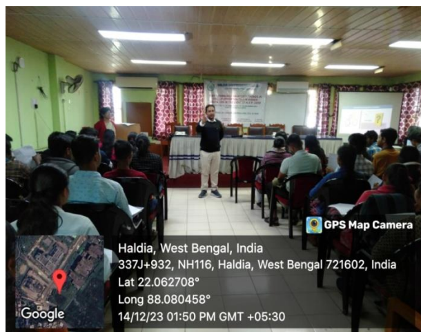
Workshop on Career Opportunity