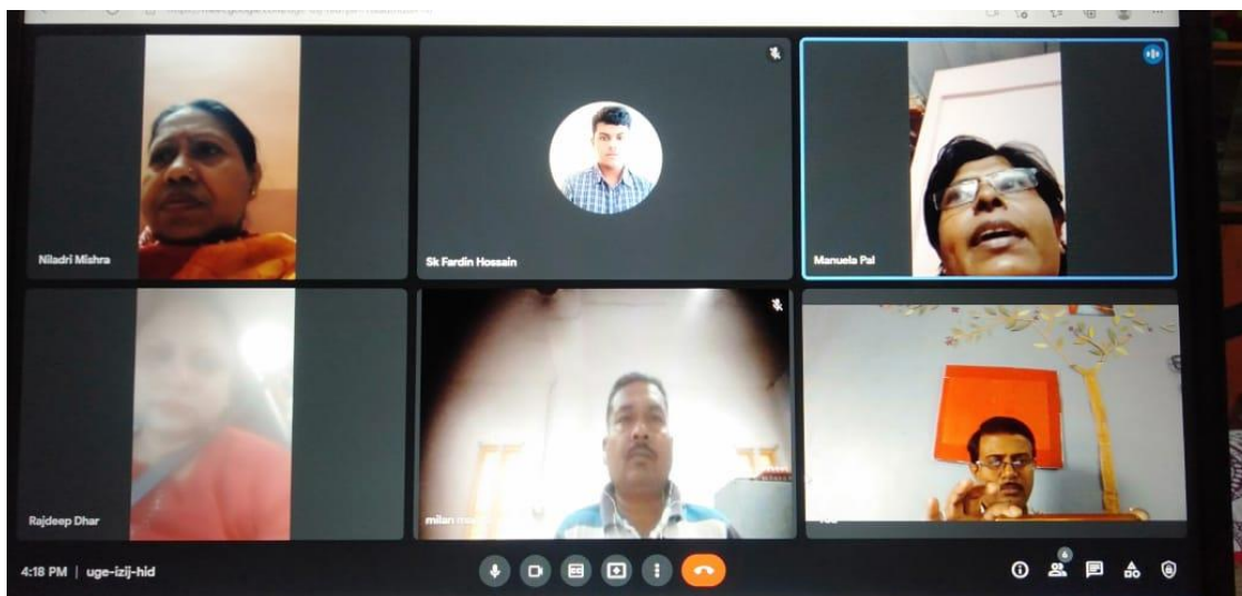
Online Parent Teacher Meeting 2021-22