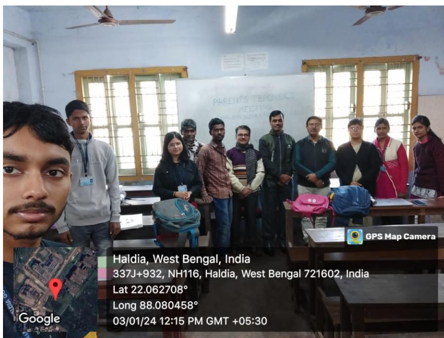
Parent Teacher Meeting, 2023-24